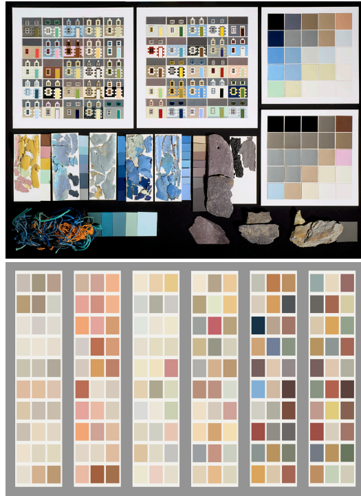
Jean-Philippe Lenclos: The Geography of Colour, methodology